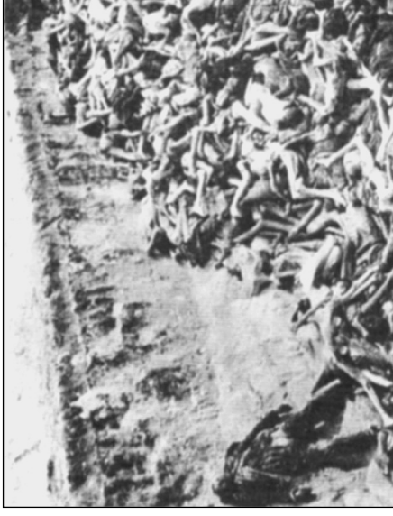
Mass grave of typhus victims in Bergen-Belsen concentration camp. Picture taken by British troops in spring of 1945.

Feel free to distribute this leaflet. You can bring this PDF file to your local copy shop and make as many photocopies as you want, or print it out on your own printer using legal-size paper.